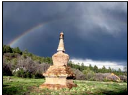
Tara Mandala Stupa