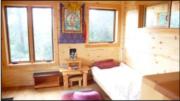
Karuna Cabin Interior