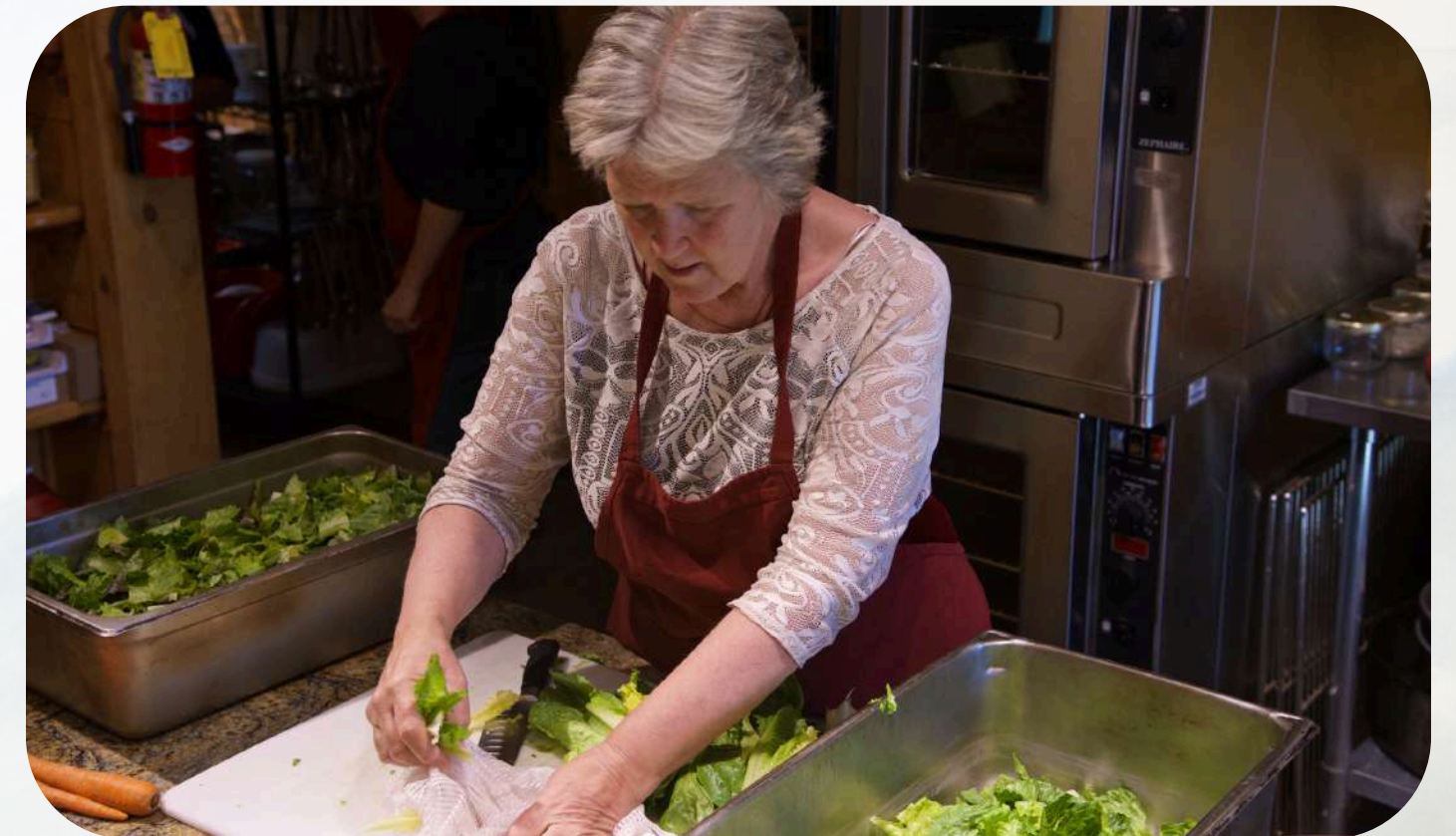
Practicing Karma Yoga in the Kitchen

Through simple tasks—cooking, cleaning, gardening—we practice awareness and care. Each participant will have the opportunity to engage in a Karma Yoga activity during the retreat.