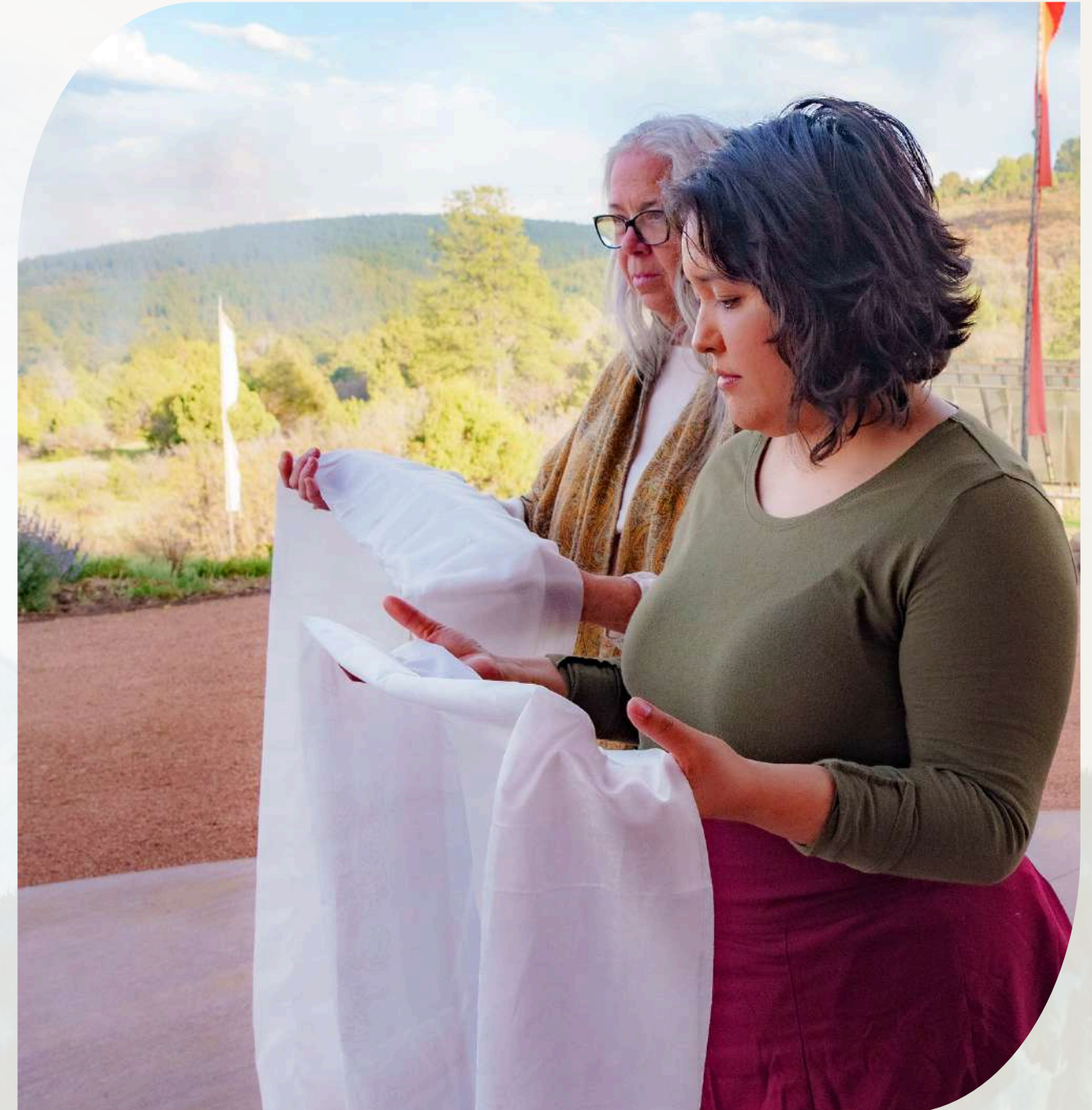
Traditional Khata Offering

Traditionally, dana offerings are given in the form of money, but they may also be physical gifts, flowers, or something meaningful offered freely from the heart. Both are entirely optional and warmly appreciated. You are welcome to follow your own ideas or ask others for guidance or inspiration.