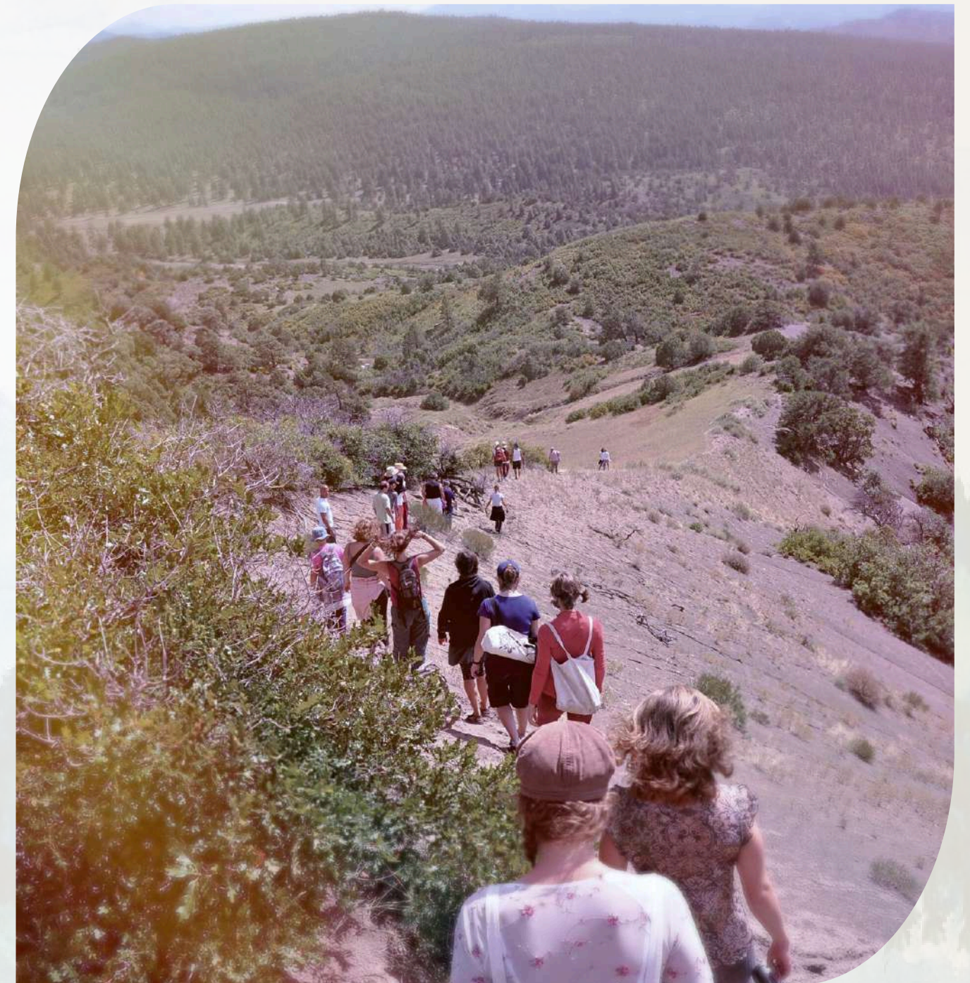
The Path to the Temple